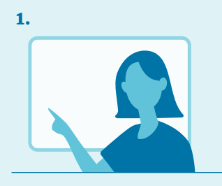
How it works:

One such adaptation is our new project, funded by the Department for Science, Innovation and Technology, which trains young people aged 14-18 to teach their peers about media literacy. We are currently piloting this model of learning in the Midlands, Greater Manchester and South and West Yorkshire. With evaluation from the National Literacy Trust, we hope to be able to learn from this 15 month pilot stage and gain the funding required to grow the programme to other regions.