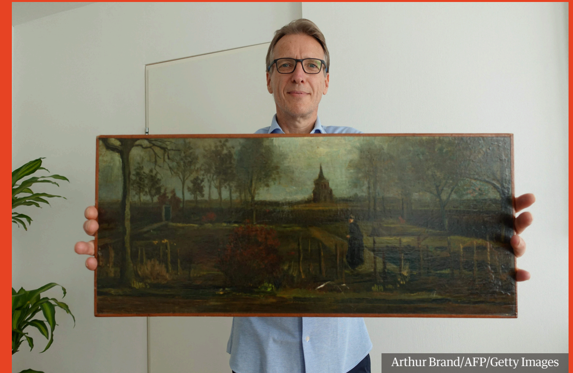
Arthur Brand/AFP/Getty Images

Private art detective helps return famous painting to the museum it was stolen from in Holland.